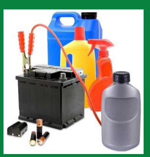
One-Day Collection Household Hazardous Waste & Electronics at Reed-Custer H.S. 249 Comet Drive Braidwood Saturday, Oct. 12 8:00am -3:00pm